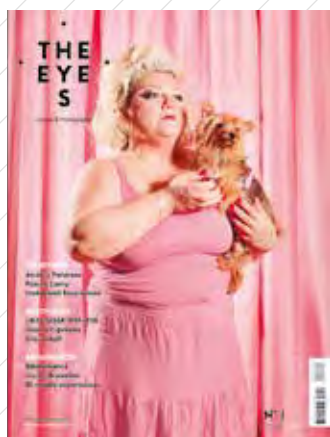
#1 - Focus on Brussels