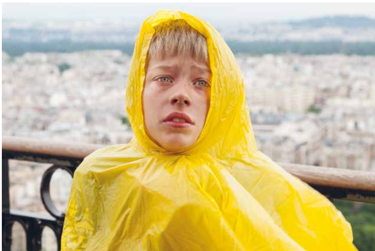
Face 228 Eiffel-Tower