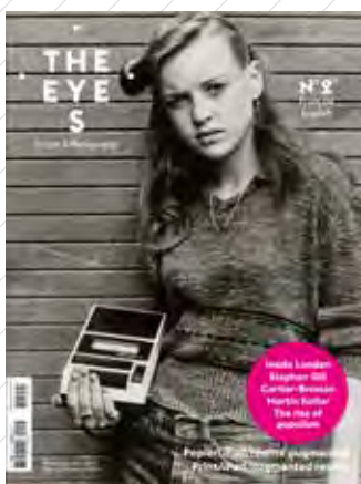
#2 - Focus on London