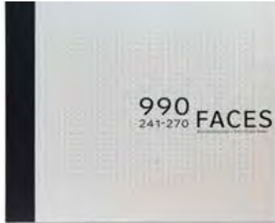
241 - 270 Brandenburg Gate